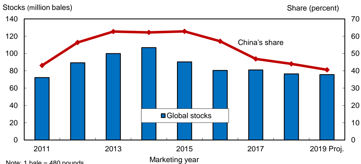
Figure 3 China's share of global cotton ending stocks