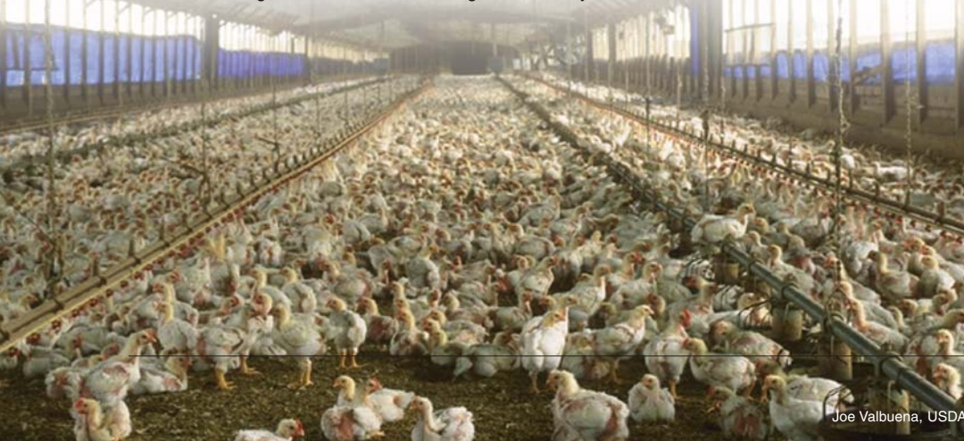
Joe Valbuena, USDA