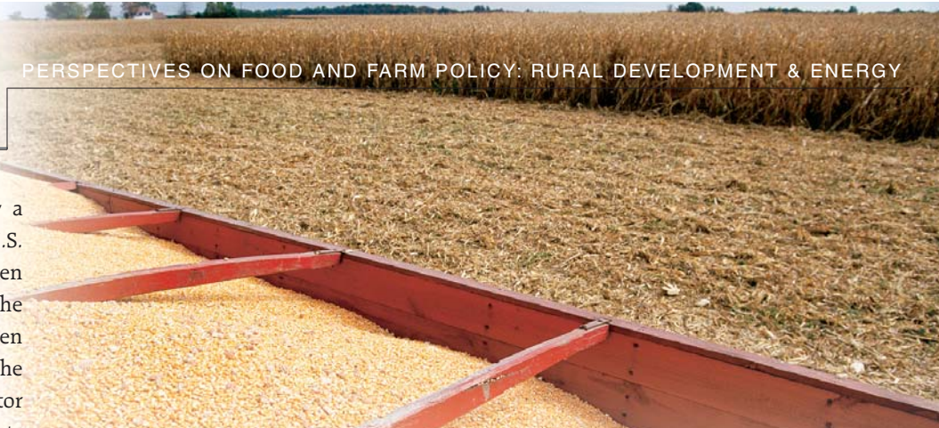
The U.S. ethanol sector is adding over 6 billion gallons to its capacity

Large corn stocks will enable U.S. ethanol production to increase initially without requiring much additional adjustment in the corn market. The U.S. ended the 2005/06 Marketing Year (MY—September 2005-August 2006) with stocks of 2.0 billion bushels, enough to produce 5.3 billion gallons of ethanol, and ending stocks declined by only 143 million bushels between MYs 2004/05 and 2005/06. As long as corn is the primary feedstock for ethanol in the U.S., however, sustained increases in ethanol production will eventually require major adjustments in the corn market.