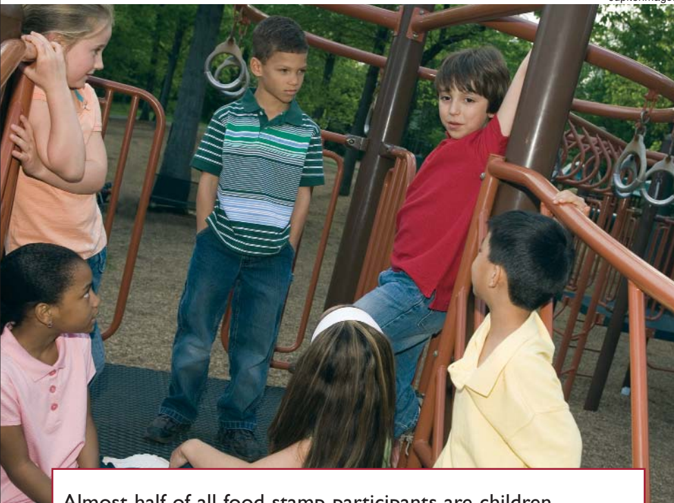
Almost half of all food stamp participants are children.

Evidence is mixed with respect to long-term food stamp participation and men's weight. One study found no relationship between long-term participation (up to 5 consecutive years) on BMI or the