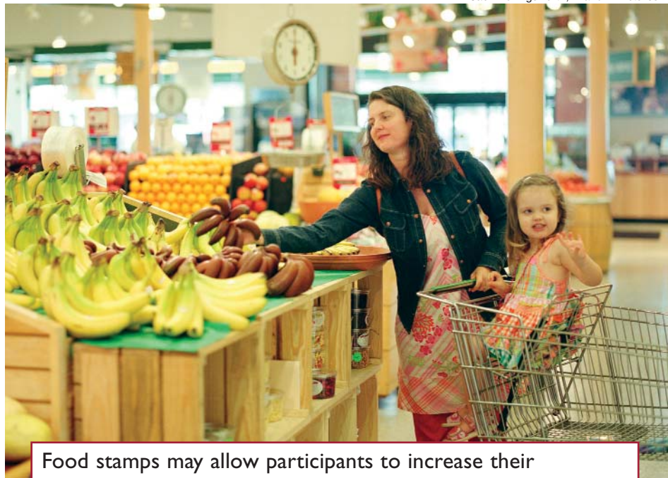
Food stamps may allow participants to increase their purchases of fruit and vegetables.

food stamp benefits to food purchases results in participants spending more money on food and, thus, consuming more food than they otherwise would if they did not participate in the program. Although food stamp benefits may have the intended effect of reducing undernourishment or underweight for at least some participants, this explanation implies that the benefits may also be pushing a portion of participants into overweight or obesity. If true, then one solution is to deliver food stamp benefits as cash. Cash benefits have been found to induce smaller increases in food spending than benefits that can be spent only on food.