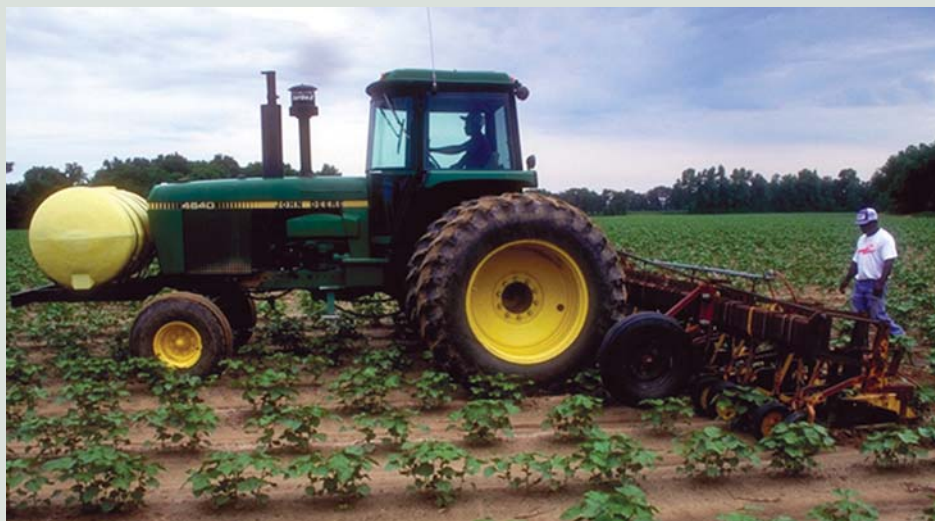
Bill Tarpenning, USDA

Some farmers have been able to reduce the effect of higher energy prices by employing more energy-efficient farming practices (although operators have been using such strategies for many years). According to the 2006 Agricultural Resource Management Survey (ARMS), 524,000 operators—representing about a quarter of all farmers—took some action to reduce fuel or fertilizer expenses in 2006. The most common practices to lower fuel expenses were to regularly service engines and reduce the number of trips over fields.