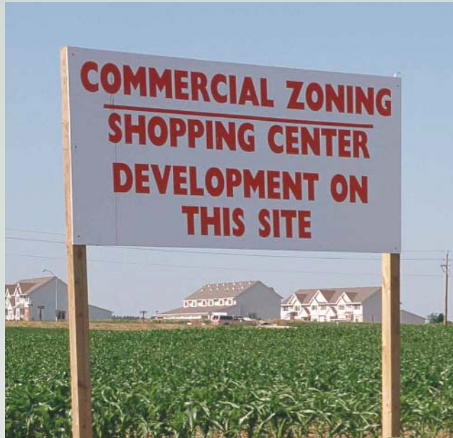
Lynn Betts, USDA/NRCS

On average, 2.2 million acres of farmland per year were converted to urban uses between 1992 and 2001. While this annual rate represents about a tenth of a percent of the Nation's farmland, conversion rates are much higher near rapidly growing urban areas. For a variety of reasons, including the amenities and environmental services provided by farmed landscapes, such losses are a public concern, demonstrated by the growing budgets and legislative support for farmland preservation programs and policies. Yet, the long-term impact of permanent farmland preservation on development trends remains an open question.